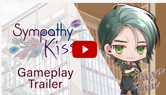
February 20: Usui Gameplay Trailer (LIVE NOW)