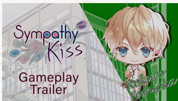
February 22: Yoshioka Gameplay Trailer (Available at 18:00pm GMT)