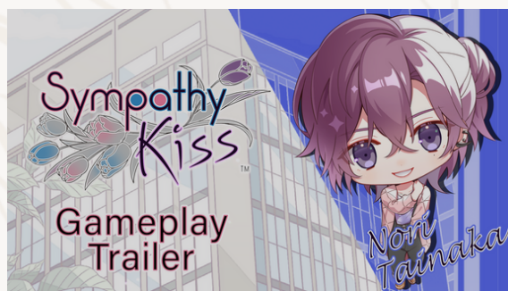
February 21: Tainaka Gameplay Trailer (Available at 18:00pm GMT)