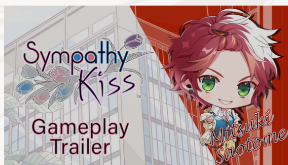
February 25: Saotome Gameplay Trailer (Available at 18:00pm GMT)