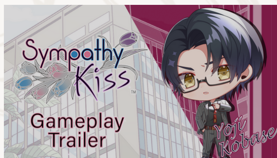
February 23: Kobase Gameplay Trailer (Available at 18:00pm GMT)