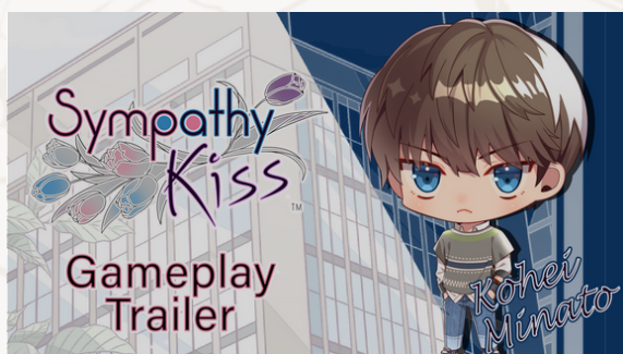
February 24: Minato Gameplay Trailer (Available at 18:00pm GMT)